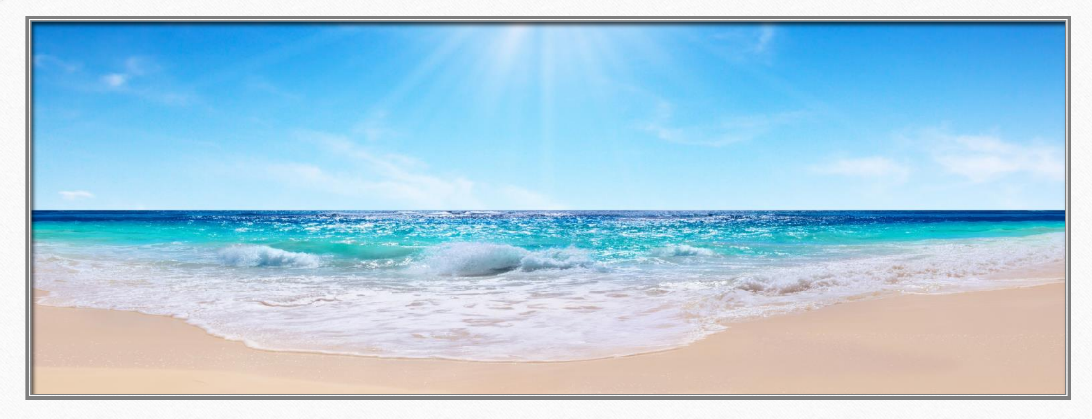
Have a great summer! Next CARE Meeting is scheduled for September !